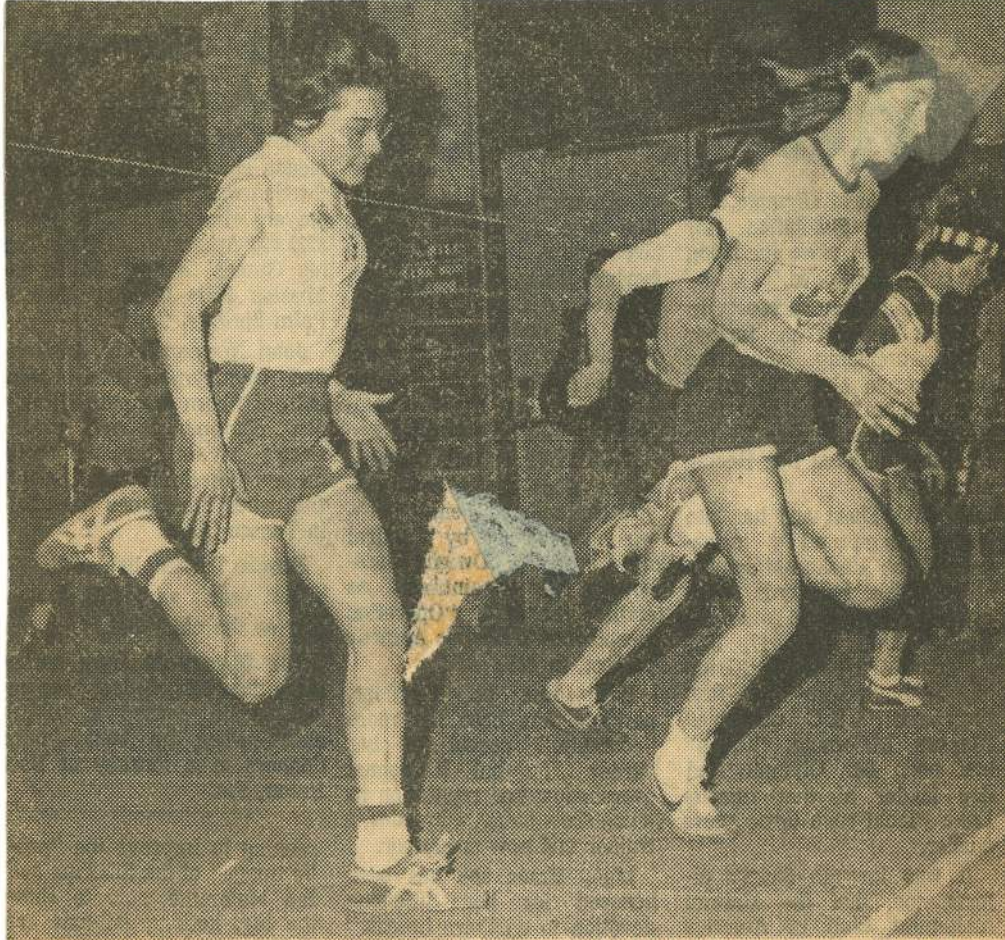
That killer headband wearing sprinter at the far right is a yet unidentified Astro.