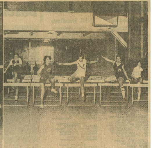
play the determination and skill that will carry some of them to the "Meet of Champions" where the best New Hampshire high school girls will compete Feb. 12 in Durham.

The Derry News ran an article for the boys' results in the State Meet on the same day. As in 1976, the Derry News neglected to run any coverage for the girls' team, now in their 2nd year.