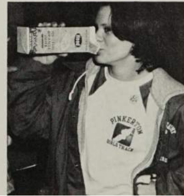
1977 Pinkerton Critic