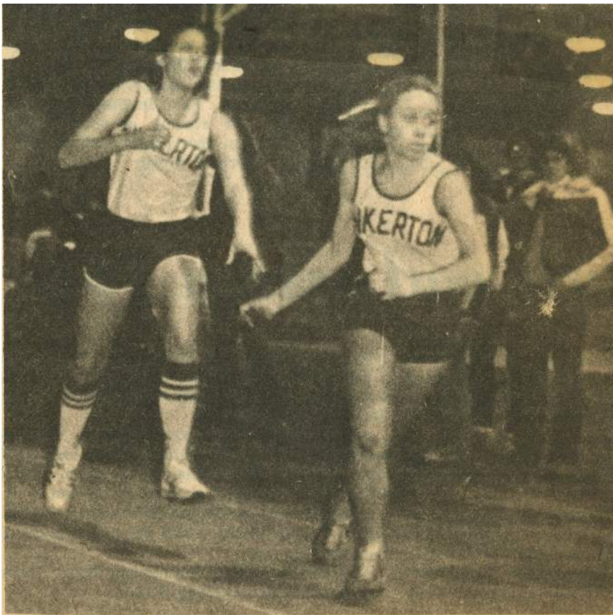
State Meet Derry News 14 February 1980