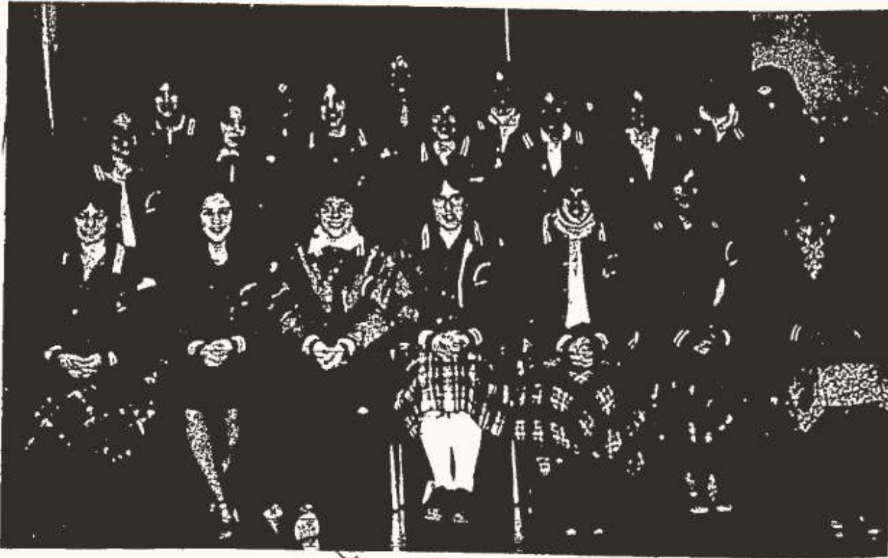
NEW ENGLAND CHAMPIONS - Members of the Pinkerton girls' cross-country

team pose with jackets they were awarded last Thursday night at the team's banquet.